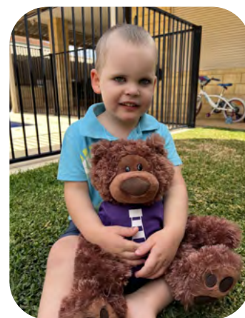
Young participants of Epilepsy Action Australia's Ted-E-Bear Connection enjoying bear cuddles